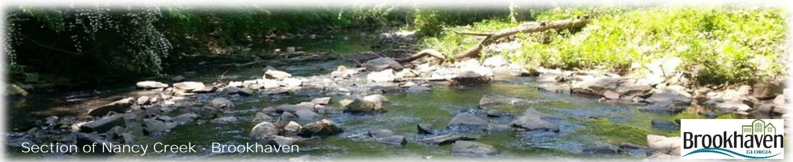
Section of Nancy Creek - Brookhaven